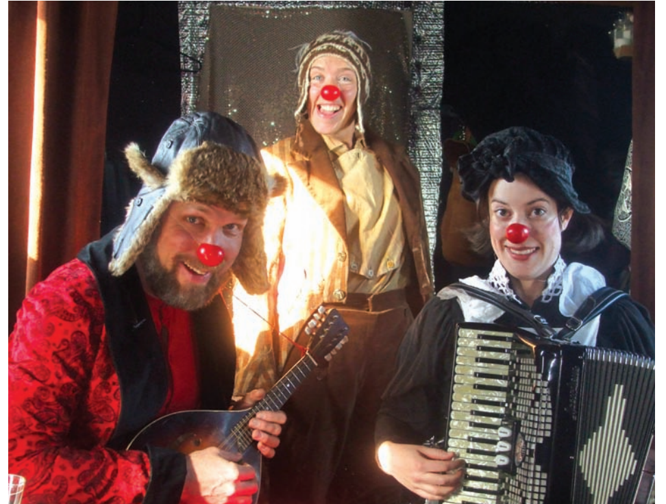
The clown cast of Uncle Sergi performing in the Black Box Theater Shanty #01 during ASP08.