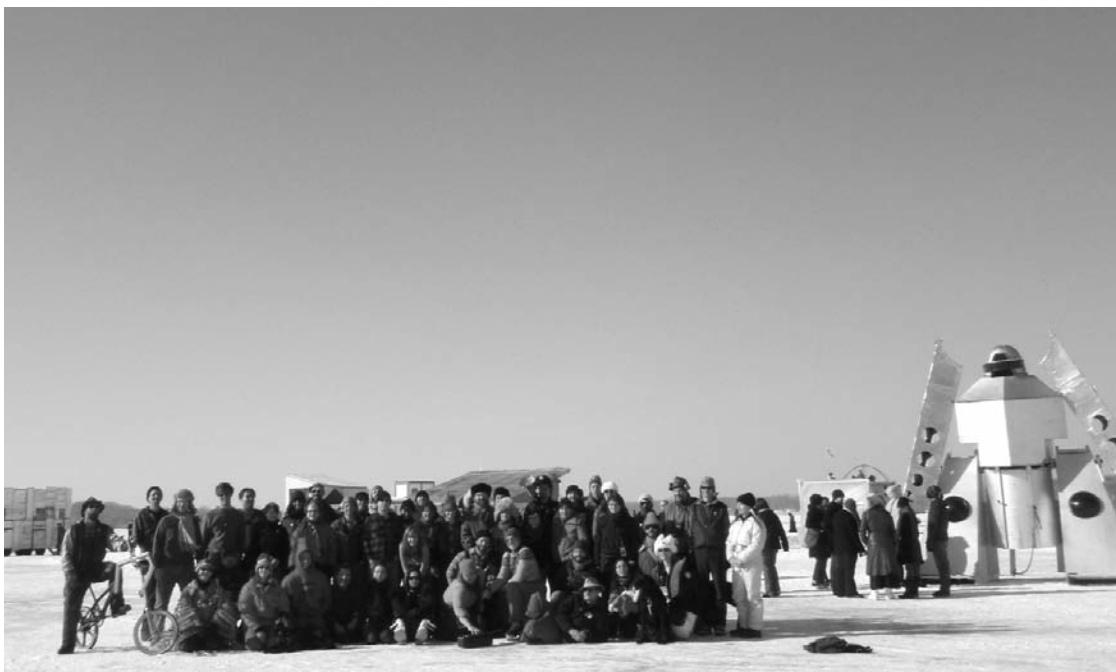
The 2008 Art Shanty Project artists and the Giant Robot Shanty line up on Medicine Lake in front of the Pinhole Shanty for a community portrait.

The fifth annual Select Media Festival features video programs, brand new media, anti-comedy, installations, performance programs, and public projects in conjunction with experimental and advanced music. Our goal is to share innovative projects in art and technology as well as socially charged work. The festival is produced by Public Media Institute, and organized by artists, musicians and activists from Chicago.