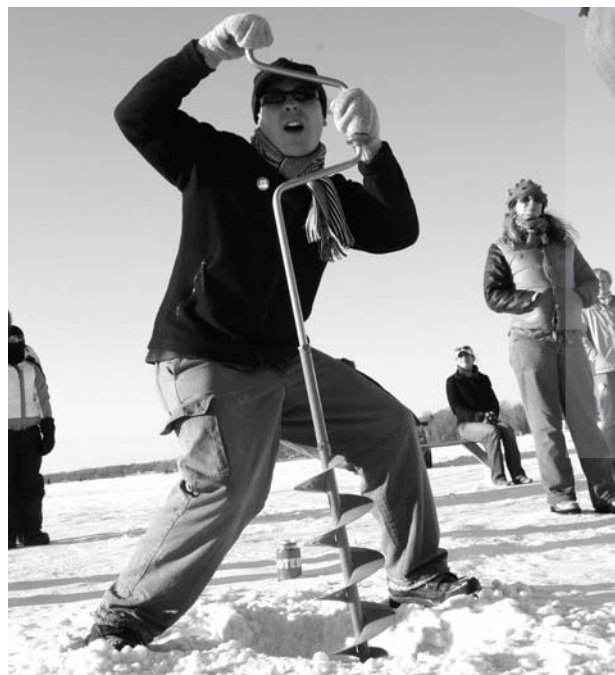
Participating in the annual Auger Races during ASP07.

proximitymagazine.com Publicmediainstitute.org Versionfest.org lumpen.com lumpentimes.blogspot.com lumpen.com/CPS/about.html reubenkincaid.blogspot.com