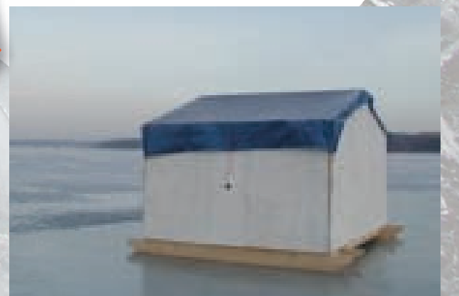
The Limnology Shanty studied Medicine Lake during ASP07.