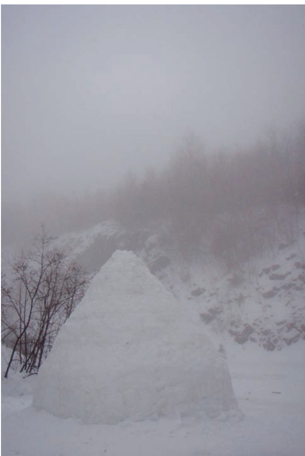
The Bigloo in Finland, MN.

The Bigloo makes its appearance again this year on a frozen lake near Finland, Minnesota