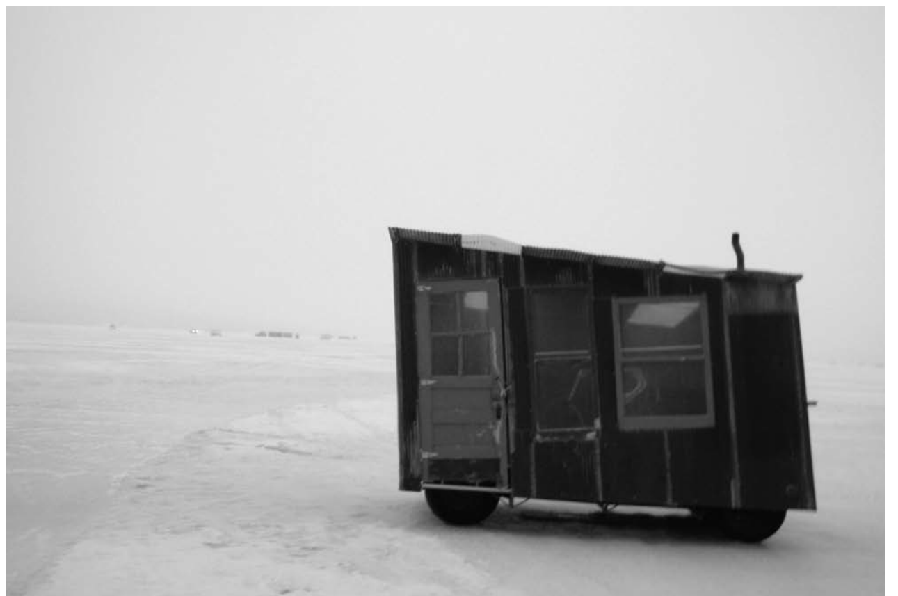
The Mobile Home Shanty rolled around the Projects propelled by half a dozen Shanty goers with adapted bicycle technology (pedals) during ASP08.