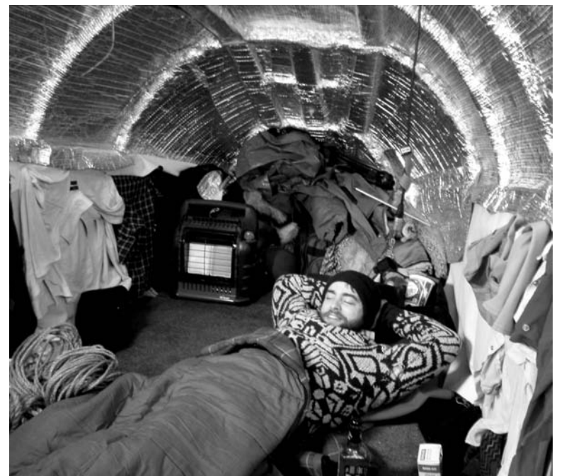
Nice and toasty inside the S.U.R.V.I.V.A.L. Shanty during ASP08.