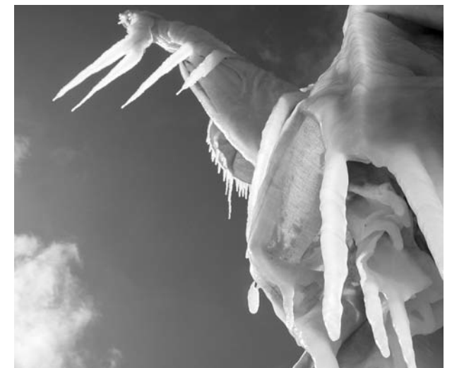
The Ice Knife on Medicine Lake in 2003.