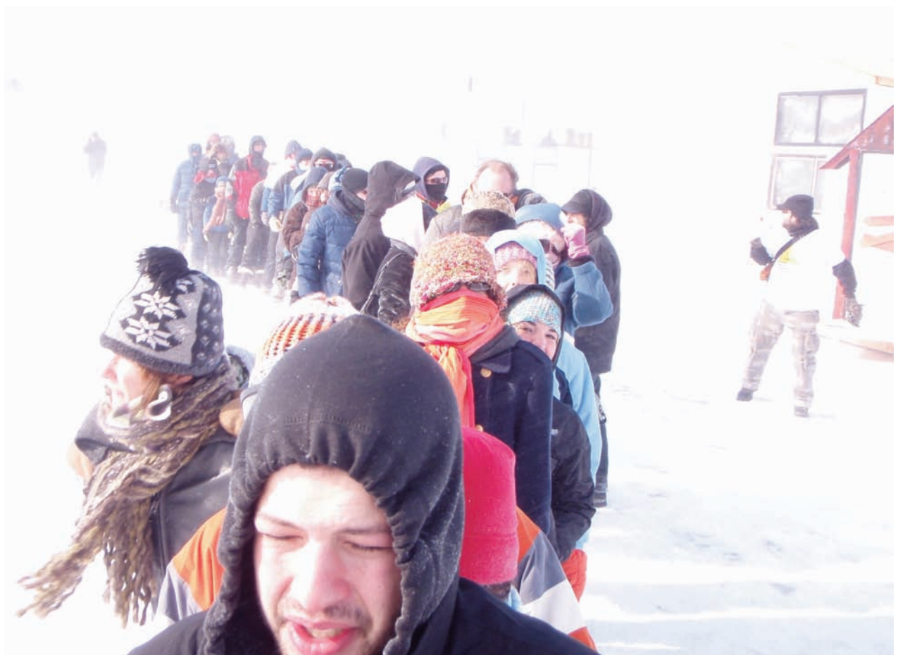
Hearty Bunny Hoppers in -50° wind chill out on the frozen ice of Medicine Lake attempting to break the Guinness World Record Bunny Hop line during ASP08. ASP09? Conga Line GWW attempt!

One and two hour slots are available. E mail proposals to: tellmethefuture@gmail.com